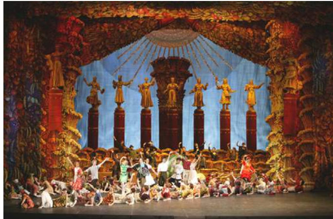
The Bright Stream at the New Stage on December 18 -20

December 23-26 – opera by Wolfgang Amadeus Mozart Le Nozze di Figaro . Libretto by Lorenzo Da Ponte after the play by Pierre de Beaumarchais. The premiere took place on April 25, 2015.