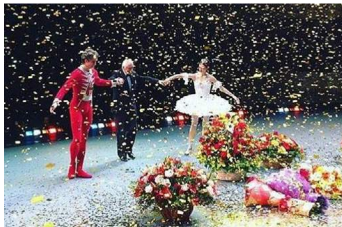
Yuri Grigorovich receiving congratulations after The Nutcracker at the Bolshoi stage.

On Sunday, December 20, screenings of the ballet The Nutcracker by Tchaikovsky (choreographic version by Yuri Grigorovich; recording of 23 December 2018) took place in hundreds of cinemas in Russia and around the world.