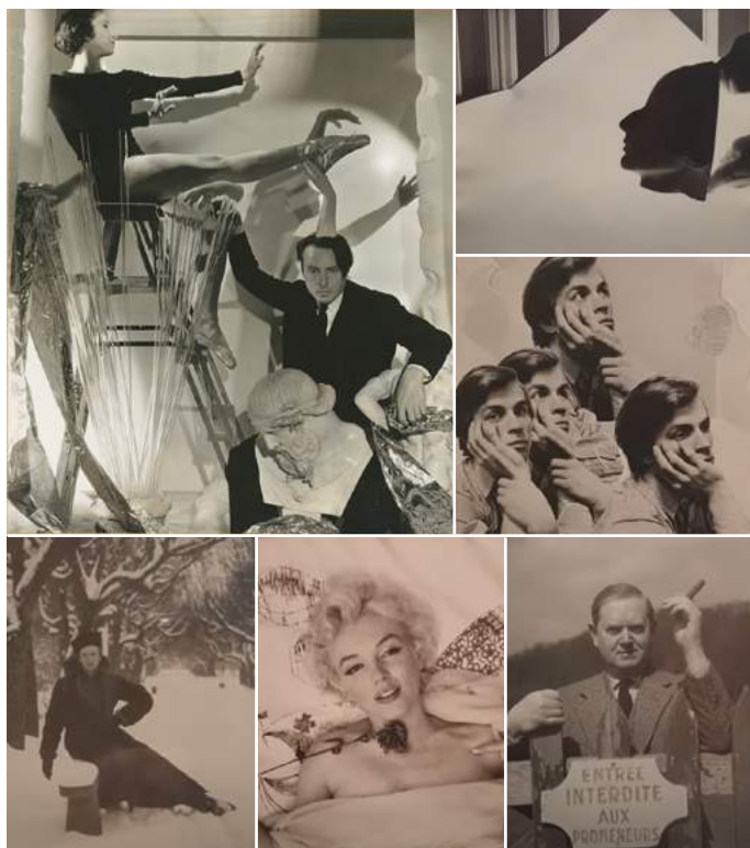
Choreographer George Balanchine (For Vogue US, 1935) photo etudes with Anna Pavlova’s mask and for the portrait of Rudolf Nureyev, self-portrait in winter Russia 1935, photo portraits of Marilyn Monroe and Evelyn Waugh – Cecil Beaton and Stars Cult

Exhibition Cecil Beaton and Stars Cult stays open to March 14, 2021, at the Hermitage, General Headquarters.