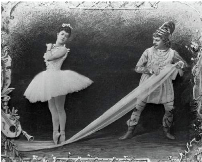
The premiere of The Nutcracker on December 18, 1892 at Mariinsky Theatre in St Petersburg