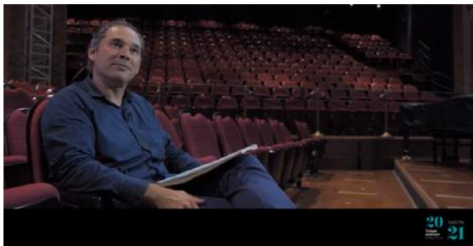
Tugan Sokhiev's video interview on the French online publication Culture 31

Link to the article and the video interview with Tugan Sokhiev