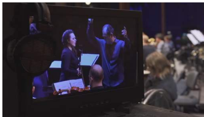
Rossia-Kultura channel showed the film Tchaikovsky. Genio Loci.

A premium version of the film will be available at the Bolshoi YouTube channel .