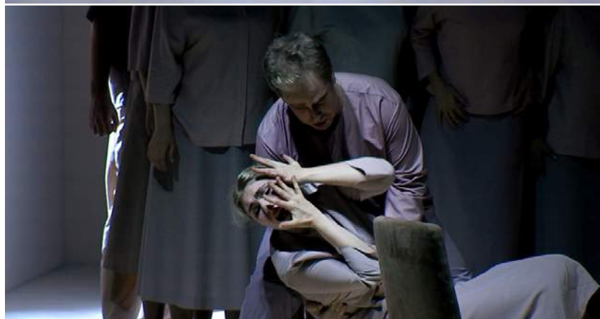
On December 10 the Bolshoi Theatre presented the opera Les pêcheurs de perles by Georges Bizet at the Chamber Stage