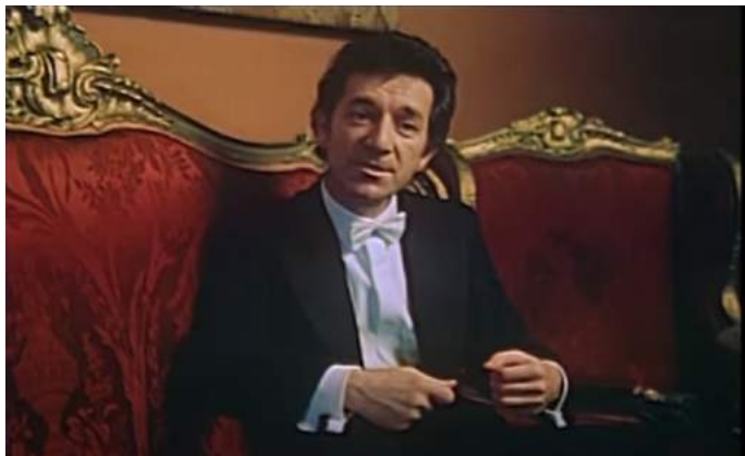
Yuri Temirkanov speaks about the opera by Pyotr Tchaikovsky Eugene Onegin

December 10 – artistic director and chief conductor of Academic Symphony Orchestra of St Petersburg State Philharmonic, National Artist of the USSR Yuri Temirkanov