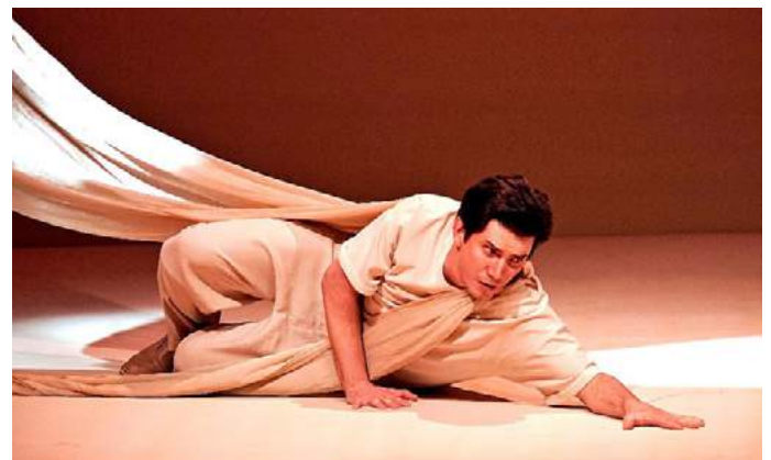
“Yaroslav Abaimov as Nadir singing an aria dedicated to his beloved Leïla.”

“The main accents in the production are on rhythm and the plastique of the actors’ movements, slowly changing set-ups, colour and light olio shimmering with all shades of pearl. They charm you with the natural beauty of the combinations. /.../ And the action unfolding as if in a time-lapse mesmerises the audience with the meditative tone of the performance.