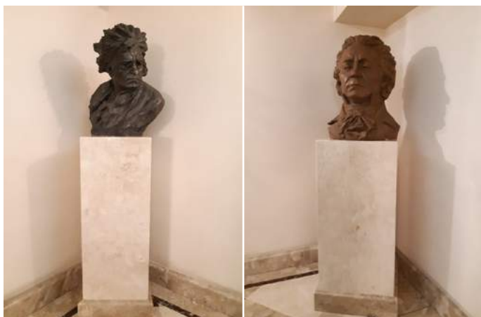
The composer's busts at the Bolshoi Beethoven Hall.

Since 1921 the Beethoven Hall hosted concerts of the Bolshoi chamber companies, outstanding national and foreign musicians performed there. Since 1966, meetings with writers, poets and actors of other theatres and foreign artists were held there, and in 1978 vocal and instrumental concerts resumed there. In the 1960s a portrait of Beethoven was commissioned from Moscow sculptor Pyotr Shapiro to grace the Beethoven Hall which was housed in the Bolshoi Imperial Foyer before reconstruction. Nowadays you can see this bust of the composer in the foyer of the new housing of Beethoven Hall where it was moved after the theatre reconstruction and restoration (2005-11.)