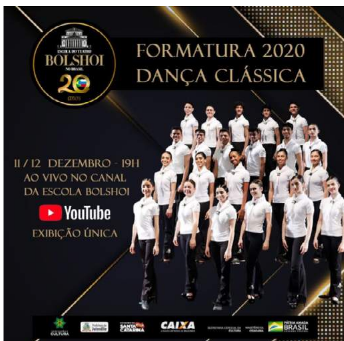
The Bolshoi Ballet School in Brazil graduation ceremony for the first time on YouTube

The Bolshoi Ballet School in Brazil , the first and only one outside Russia, started its work on March 15, 2000 in Joinville, Santa Catharina. The school' method and system of training corresponds that of the Russian choreographic school.