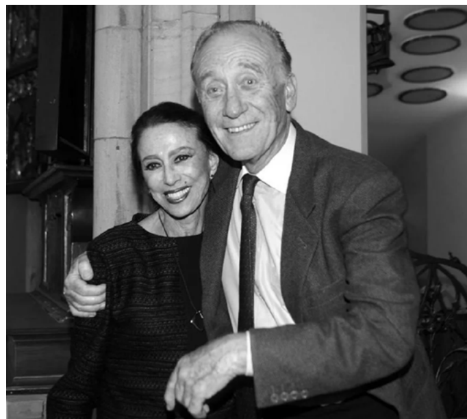
Rodion Shchedrin and Maya Plisetskaya

December 16 – composer, pianist, National Artist of the USSR Rodion Shchedrin.