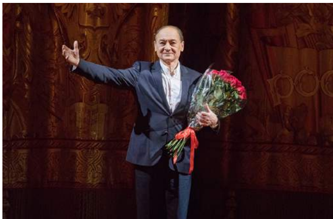
Mikhail Lavrovsky.

See more about the opera and the history of its productions at the Bolshoi