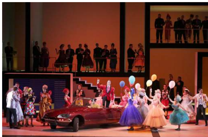
A scene from the opera Le Nozze di Figaro.