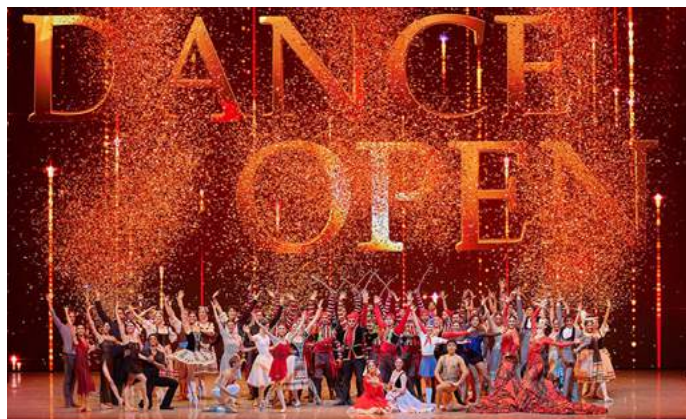
The ballet festival Dance Open finale with an international gala at Oktyabrsky Grand Concert Hall in St Petersburg

production with fresh and easy optimism hardly expected in our dark times.”