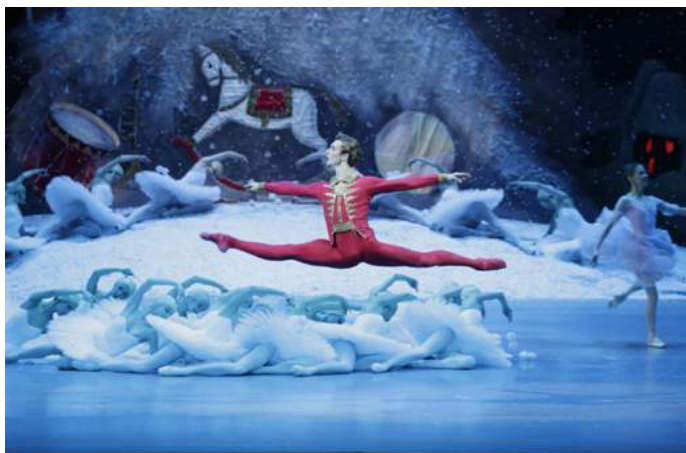
The Bolshoi Ballet principal Semyon Chudin as Prince-Nutcracker – a shot from the screening of The Nutcracker by the Bolshoi.