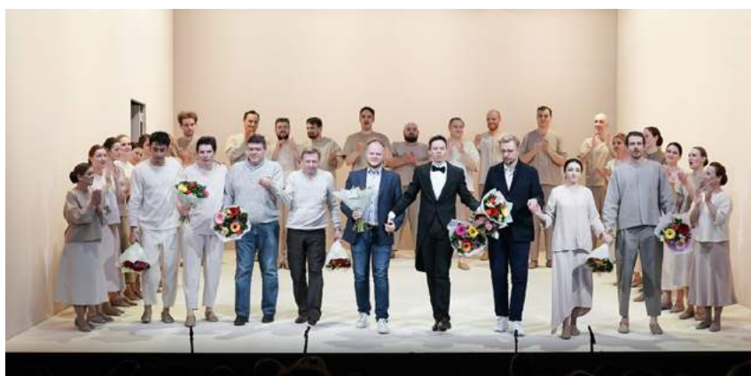
Les pêcheurs de perles – singers and the production creators at curtain calls.