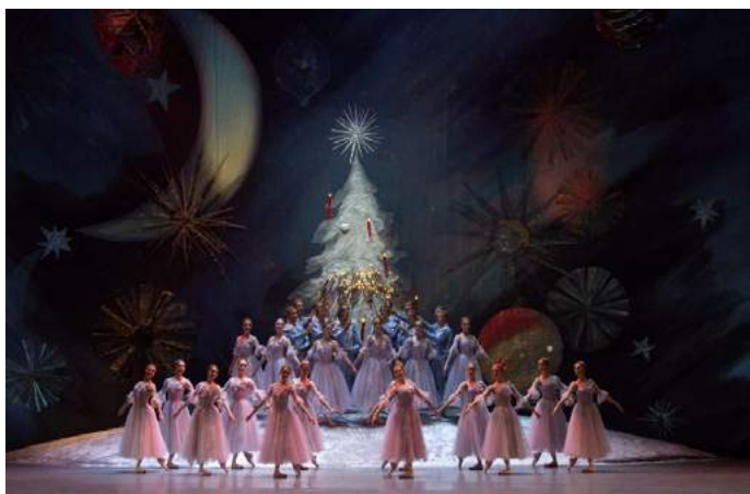
The Bolshoi Ballet’s Nutcracker , a livestream recording from Moscow / Avont Theatre

CA Noticias (Portugal): “The Nutcracker – Bolshoi, full of magic and fantasy – on December 22 in cinemas of Portu and Lisbon.”