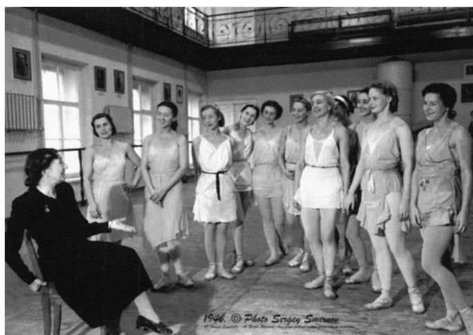
Leningrad Ballet School. – tutor and ballet-mistress Agrippina Vaganova with her pupils (left to right from Vaganova - Feya Balabina, Alla Shelest, Nina Zheleznova, Olga Moiseeva, Ninel Petrova, Nonna Yastrebova, Natalia Dudinskaya, Inna Zubkovskaya, Galina Kirillova, Tatiana Vecheslova.