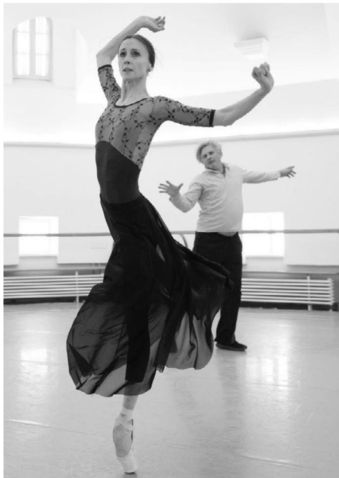
Svetlana Zakharova at the rehearsal of her new programme at the Bolshoi, April 2019.

The RF President decree of April 29, 2019, No.199 is available on the official legal information website (*.pdf)