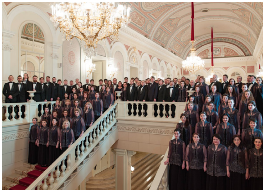
The Bolshoi Choir was given the International Opera Award as the Best Opera Choir of 2019