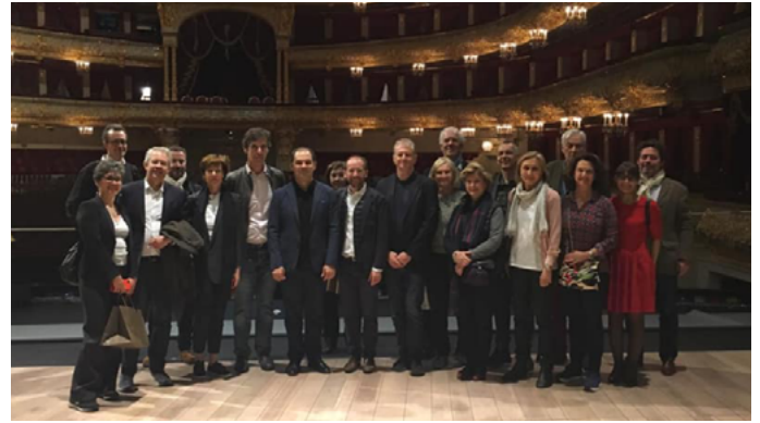
Chief conductor and music director Tugan Sokhiev with the guests from Paris, April 28.