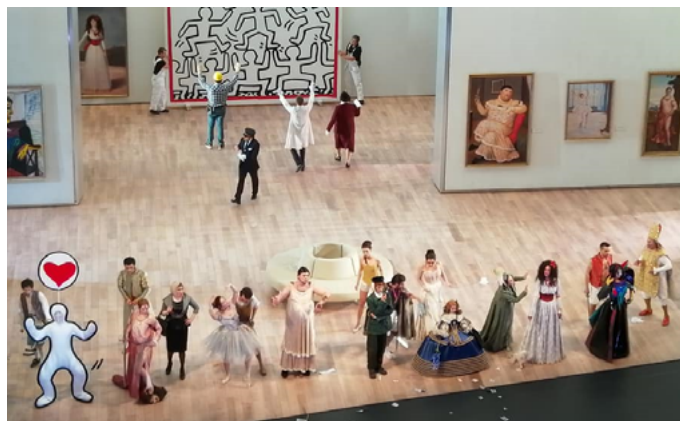
Il Viaggio A Reims. A scene from the opera

May 2 (12:00 and 19:00), 3, 4 (12:00 and 19:00) and 5 (14:00), Historic Stage – Tchaikovsky's ballet The Sleep-