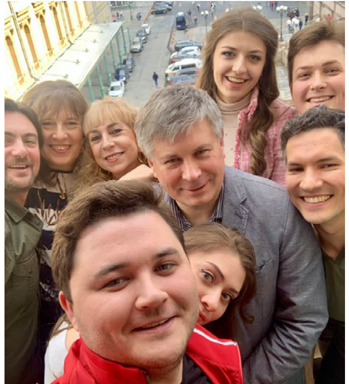
After the Youth Opera Program concert for Heroes of Russia Club in honour of the Victory Day, May 5.

The programme included Pictures at an Exhibition by Modest Mussorgsky, Carmen Suite by Georges Bizet,