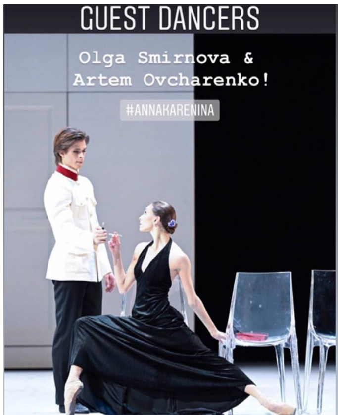
Artem Ovcharenko and Olga Smirnova dance in Anna Karenina by John Neumeier on May 8 and 9, Hamburg.

Artem Ovcharenko and Olga Smirnova danced as guest soloists in Anna Karenina by John Neumeier on May 8 and 9 (as Alexei Vronsky and Anna Karenina respectively) at the Staatsoper Hamburg. Full cast