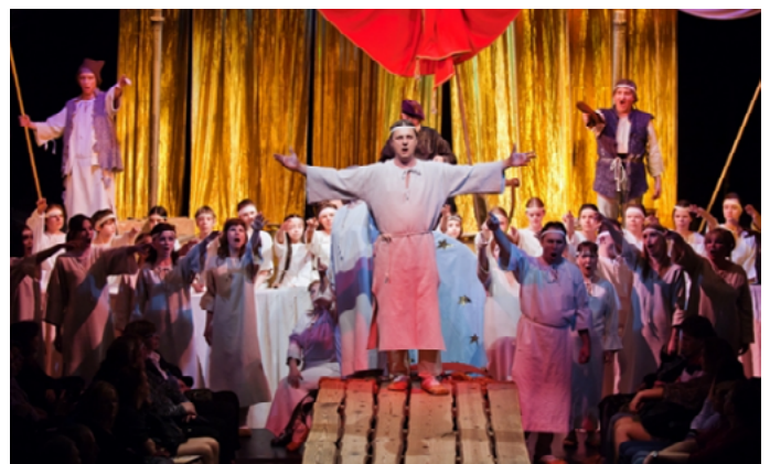
Opera The Rostov Mystery at Pokrovsky Chamber Stage. A scene from the opera