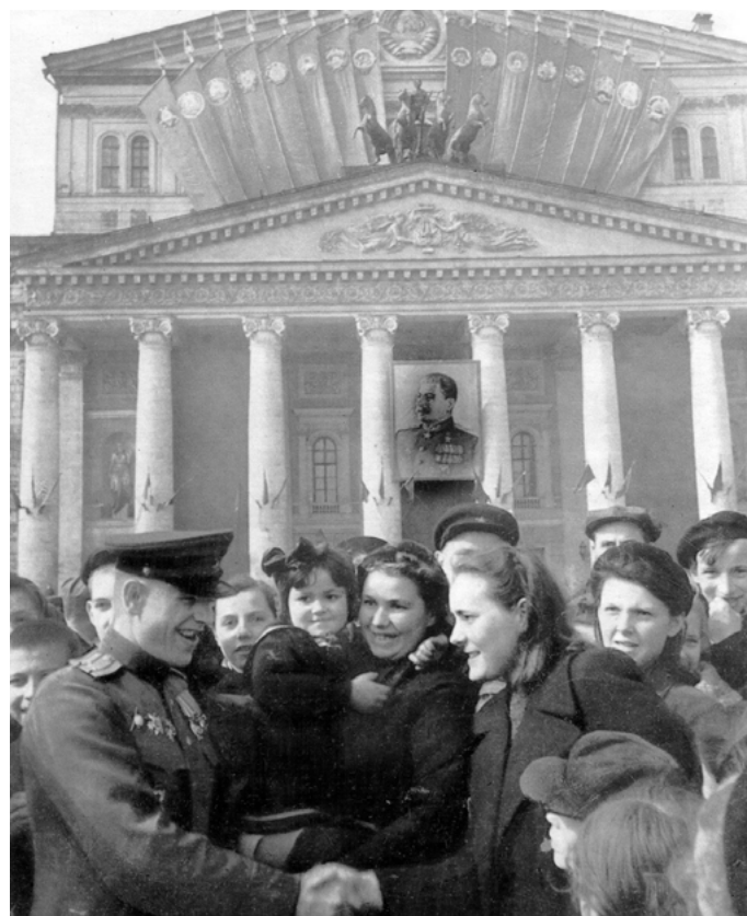
Sverdlov (now – Theatre) Square. Street party on the Victory Day, May 9, 1945.

On May 9 in honour of the celebration of the 74th anniversary of the Victory in World War II a gala concert was held at the Historic Stage of the Bolshoi Theatre. The Bolshoi Opera soloists and members of the Bolshoi Theatre Youth Opera Program took part in the concert.