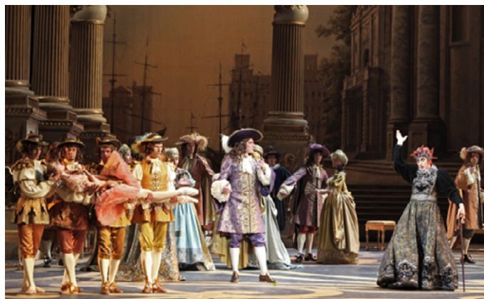
The Sleeping Beauty at the Historic Stage