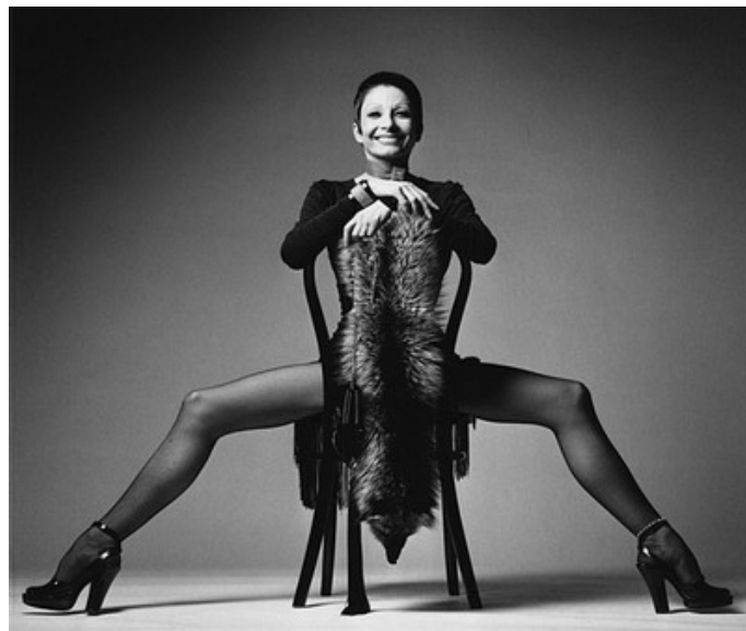
Zizi Jeanmaire, 1978

On April 29, the International Day of the Dance, Zizi Jeanmaire turned 95.