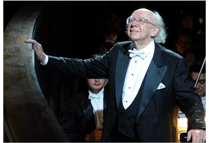
Gennady Rozhdestvensky

May 4 – conductor, pianist, composer and National Artist of the USSR Gennady Rozhdestvensky