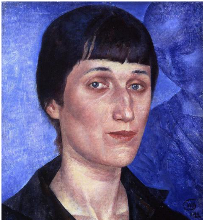
The Portrait of Anna Akhmatova by Konstantin Petrov–Vodkin

June 23 – Anna Akhmatova (1889–1966) – 130th anniversary