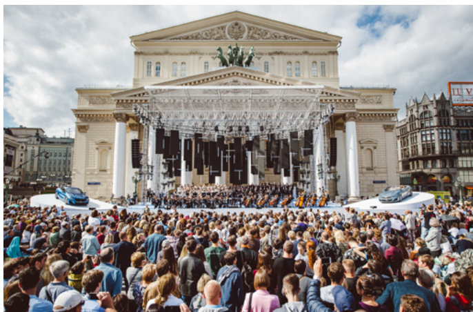
The second concert BMW Opera Without Borders took place 7 July 2019

BMW Opera Without Borders at BMW Group Russia website