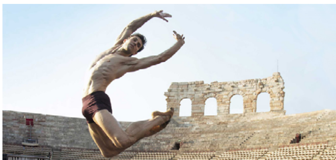
Roberto Bolle – Arena di Verona–2019

On July 13 at the Square of the Most Holy Annunciation (Piazza della Santissima Annunziata) in Florence (as part of MusArt Festival 2019).