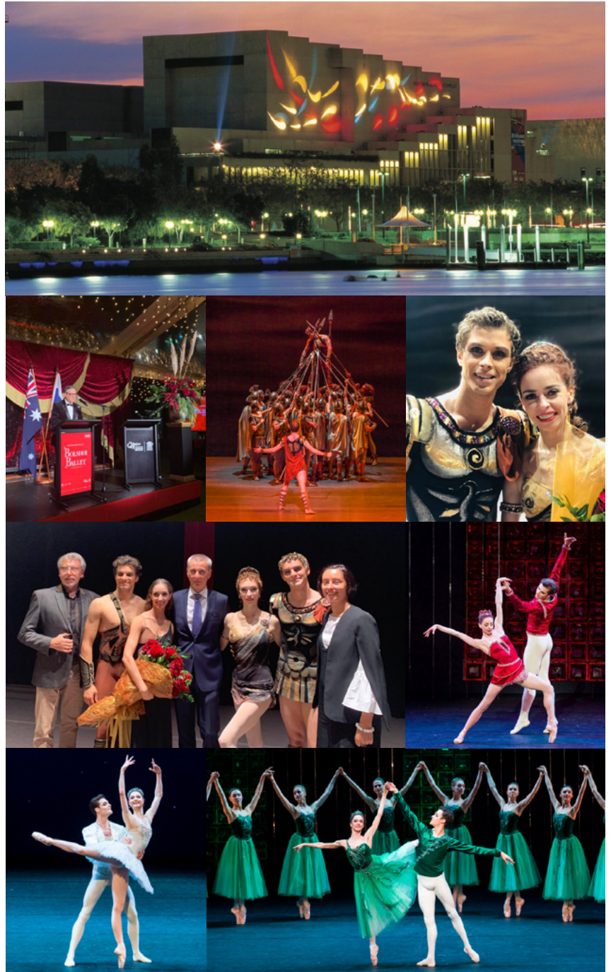
Brisbane Lyric Theatre / QPAC.

The Bolshoi Australian tour to Brisbane, Queensland, at the Lyric Theatre of The Queensland Performing Arts Centre (QPAC) is was a triumph. The programme includes two productions: Spartacus by Yuri Grigorovich to music by Aram Khachaturian (8 shows), and Jewels by Balan-