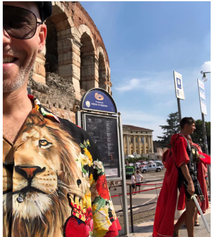
Johan Kobborg before Arena di Verona, June.

The show will run until September 7. Programme