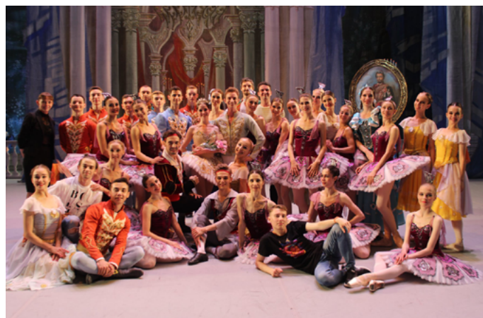
The Glinka Opera and Ballet Theatre company after the performance of Paquita on June 26.