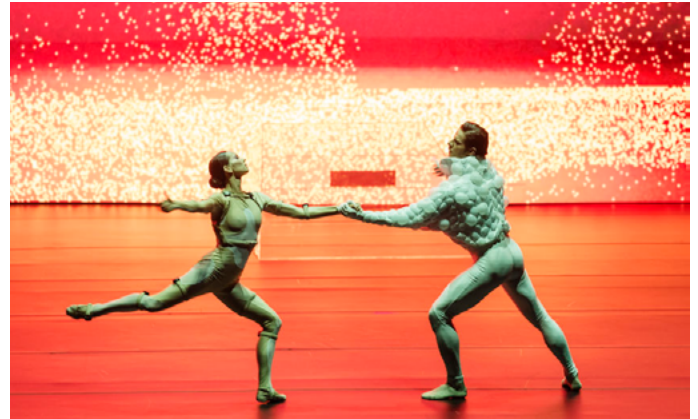
Scene from Sleeping Beauty Dreams.

and 15, on September 20 the show will move to the Crocus City Hall in Moscow, the performance will then leave for the Russian regions, and then to the USA, Canada, Latin America, Europe and Asia. The world première of the Sleeping Beauty Dreams was held in Miami in December 2018.