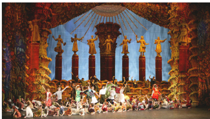
The Bright Stream.

Famous ballets Spartacus , The Swan Lake , Don Quixote and comic ballet in two acts by Dmitry Shostakovich The Bright Stream will be performed at Covent Garden.