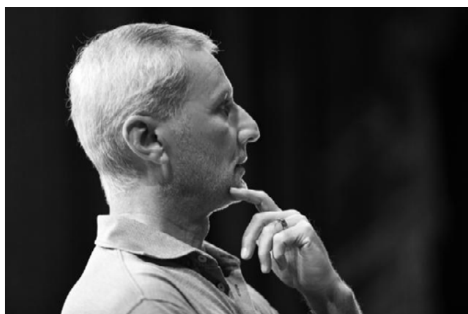
Makhar Vaziev

June 16 – the ballet company director, National Artist of Russia Makhar Vaziev