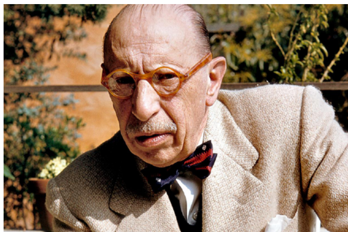
Igor Stravinsky in Hollywood.

June 17 – composer Igor Stravinsky (1882–1971)