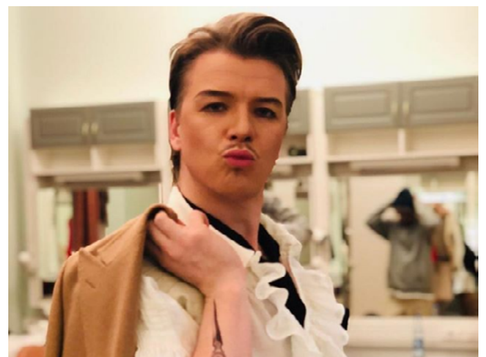
Konstantin Shushakov as Figaro.

July 2 – Konstantin Shushakov, Bolshoi opera soloist