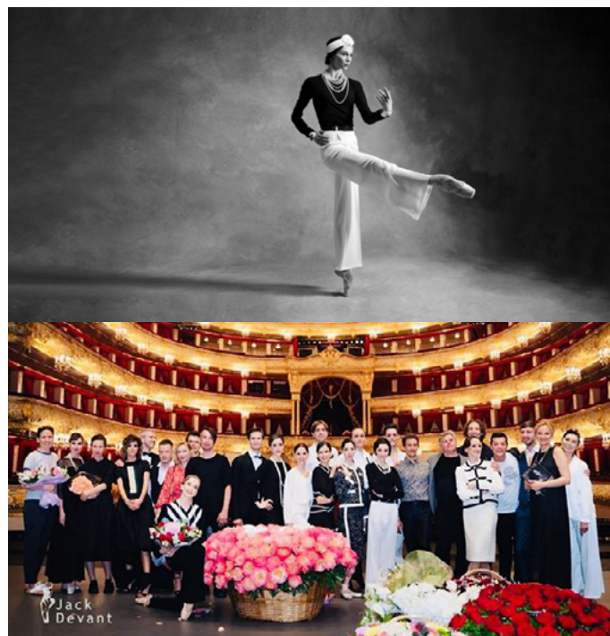
The world premiere of the programme Modanse with the Bolshoi prima ballerina Svetlana Zakharova on June 22 and 23 at the Bolshoi Historic Stage

The Bolshoi completes its 243 season with a double tribute to the composer marking the 200th anniversary of his birth in 2019. On June 13–16 the premiere of Gaité Parisienne by Maurice Bejart to music by Jacques Offenbach took place at the Bolshoi New Stage.