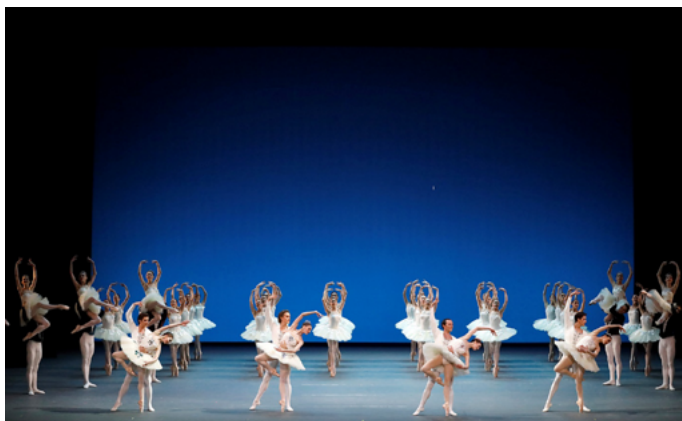
Scene from the Symphony in C.

Press reviews continue to cover the Bolshoi premières.