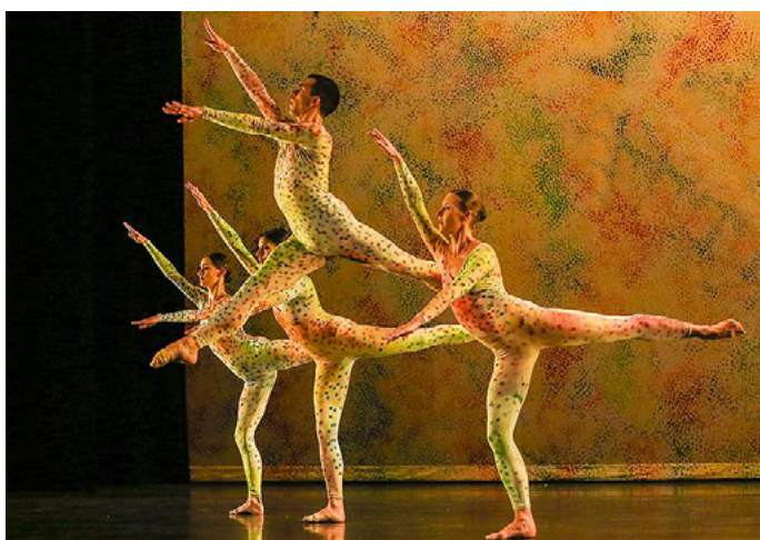
«The performance of Merce Cunningham Summerspace (1958) has turned out not to have lost integrity and radiance.»