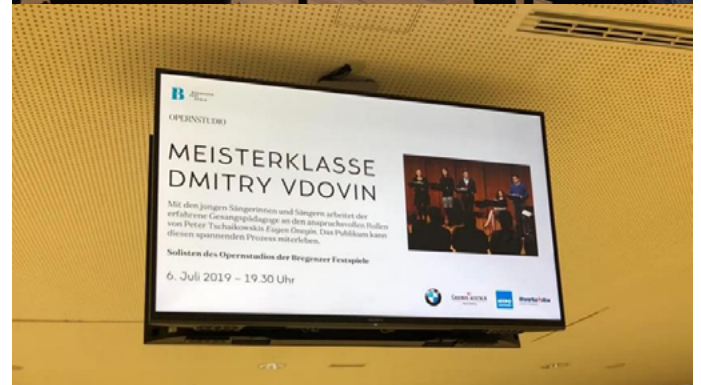
On July 6, Dmitry Vdovin will hold a workshop at the Bregenz Opera Studio.