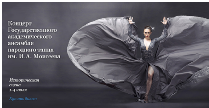
State Academic Folk Dance Company of Igor Moiseyev

The concert programme for July 3 and 4 (*.pdf)