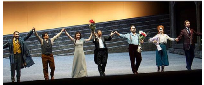
Curtain calls after the performance La Bohème; the New Stage.

June 28, 29 (12:00 and 19:00), 30, the New Stage — La Sylphide to the music by Herman Severin Levenskiold.