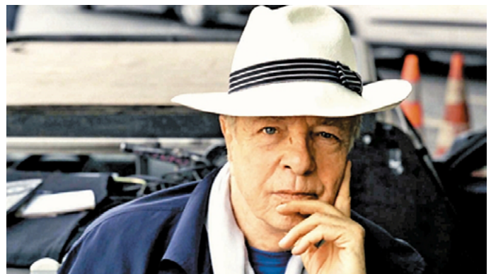
Zeffirelli Forever.

“I have three wives — opera, drama and cinema — they come to my bed alternately,” said Franco Zeffirelli. Quotes of the great director, whom Florence said farewell to on July 17, collected by Sobesednik .