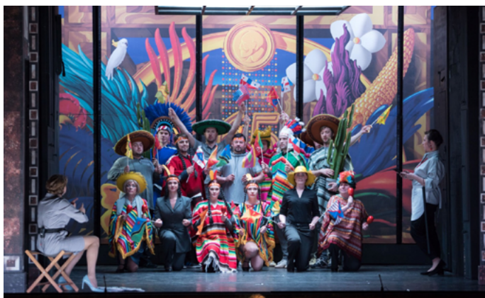
Opera-buffo La Périchole by Jacques Offenbach.

There is a special exhibition I Am Spartacus in the Centre.