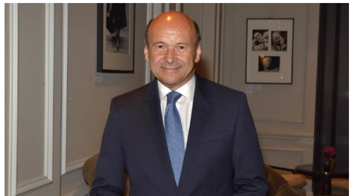
Dominique Meyer.

Frenchman Dominique Meyer, the acting director of the Vienna Opera, has been approved as the new director of La Scala.