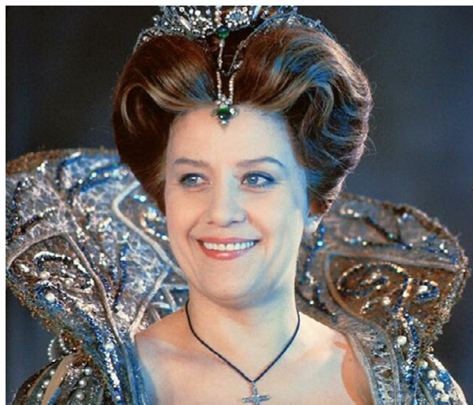
Elena Obraztsova as Maryna Mniszech in the opera Boris Godunov by Mussorgsky

July 7 – opera singer, National Artist of of the USSR Elena Obraztsova (1939–2015) – 80th anniversary of her birth