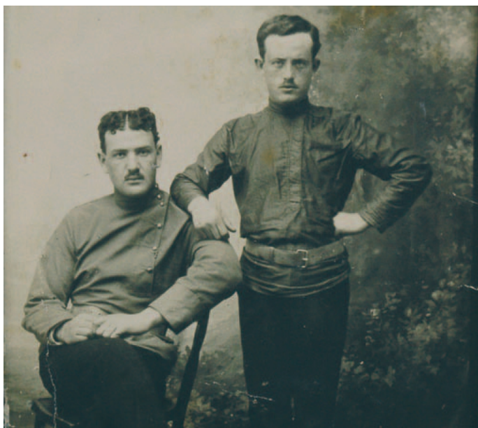
Mark Reizen (left) during World War I

July 3 – opera and chamber bass, mentor, National Artist of the USSR Mark Reizen (1895–1992); in 1930–1954 – the Bolshoi Opera soloist (up to 1985)