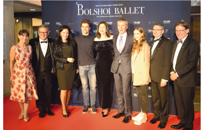
At the formal party at Queensland Performing Arts Centre