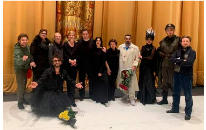
Singers after the performance of Manon Lescaut on December 11, the Historic Stage.

Curtain calls video after the performance of December 11 on FB .