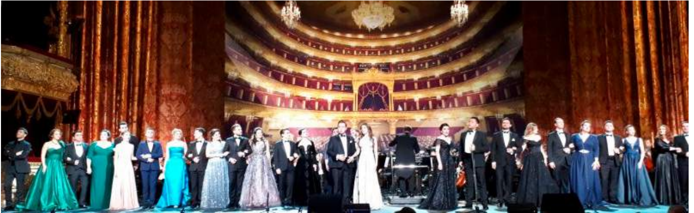
A gala of the Bolshoi YOP members and graduates 10 Years of the Bolshoi Theatre Youth Opera Program