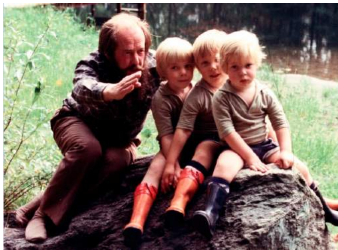
Alexander Solzhenitsyn (1918-2008) with his sons in Vermont.

December 10 — writer, Nobel Prize winner (1970) Alexander Solzhenitsyn.