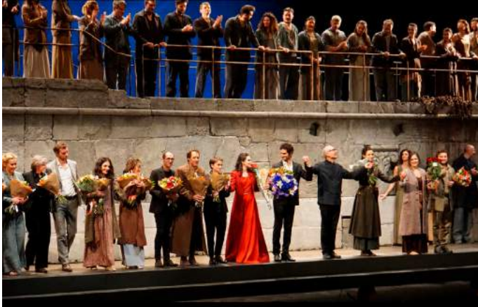
Curtain calls after the premiere on December 5.