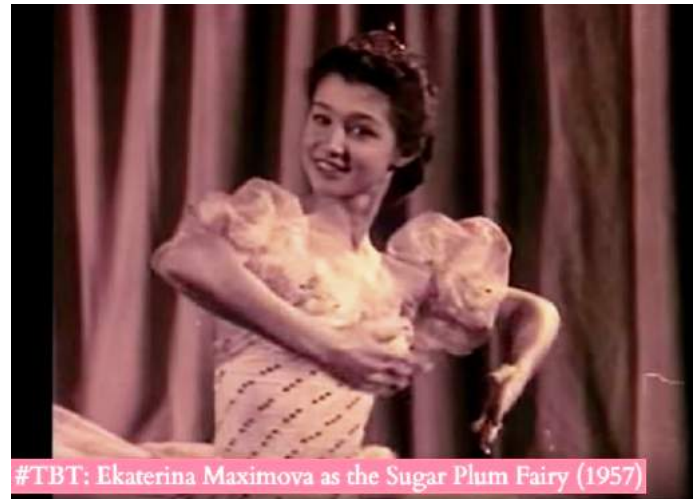
#TBT: Ekaterina Maximova as the Sugar Plum Fairy (1957)

The English language Cyprus newspaper Cyprus Mail publishes an article by Eleni Philippou