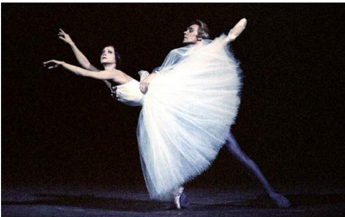
Laureates of the State prize of the USSR, people's artists of the USSR Ekaterina Maximova and Vladimir Vasiliev in Adolphe Adam's ballet Giselle. The Bolshoi Theatre, USSR, 1989

From December 14th to 24 in St Petersburg the 20th international winter festival Arts Square took place – reports Kultura channel . The Academic symphonic orchestra of the St Petersburg Philharmonic participated in the opening concert at the Grand Hall on December 14.