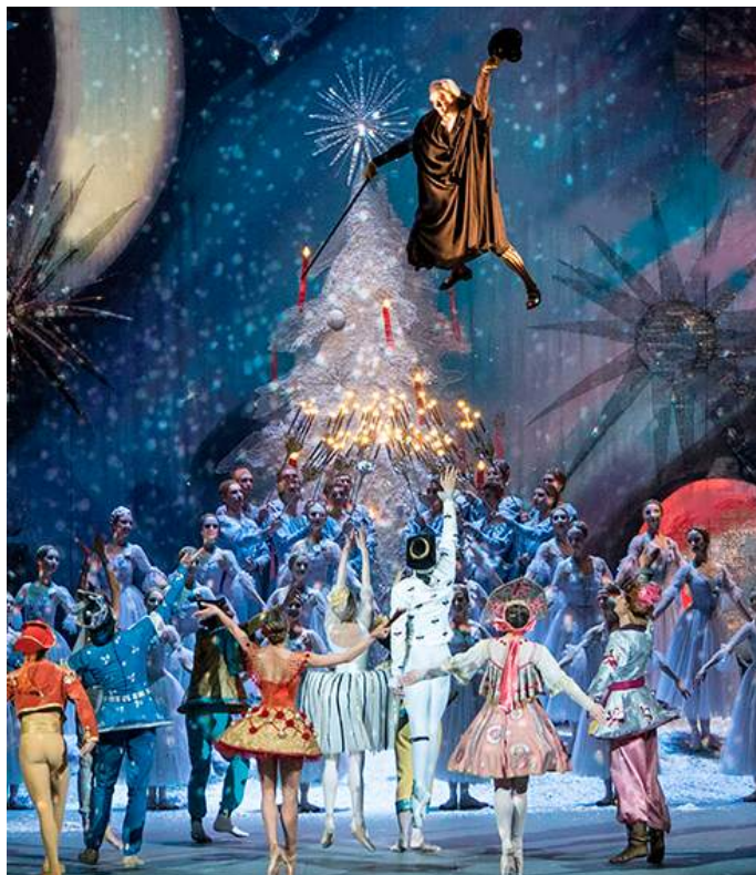
The Nutcracker performance, the Bolshoi Historic Stage.