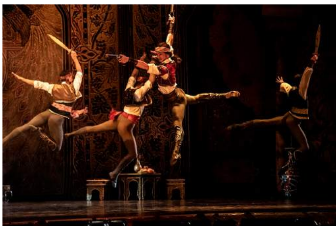
The premiere run of the ballet Le Corsaire was shown in the Pushkin's Nizhny Novgorod State Academic Theatre of Opera and Ballet.

In January 2020 in Moscow begins the 26th Festival Golden Mask . Journal Company: