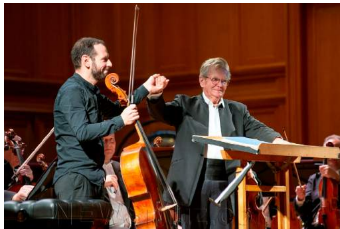
Boris Andrianov and Vladimir Fedoseyev at the concert 100 years to Mieczysław Weinberg, December 13.

Weinberg 100 on the Muzykalnoye Obozrenie .