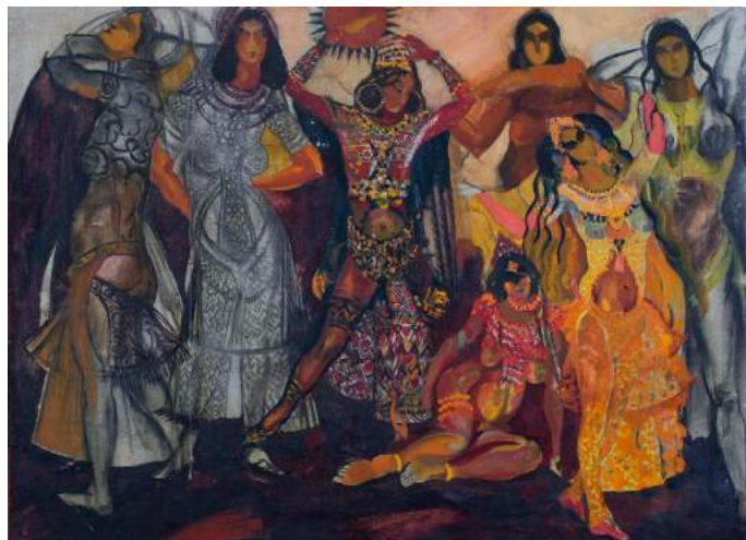
Costume draft by Fyodor Fedorovsky Polovtsian Women for the opera Prince Igor by Alexander Borodin. 1934.

The Bolshoi Theatre Museum has loaned the project more than 50 items - sketches and costumes of “fairytale” productions of the Bolshoi from various years.