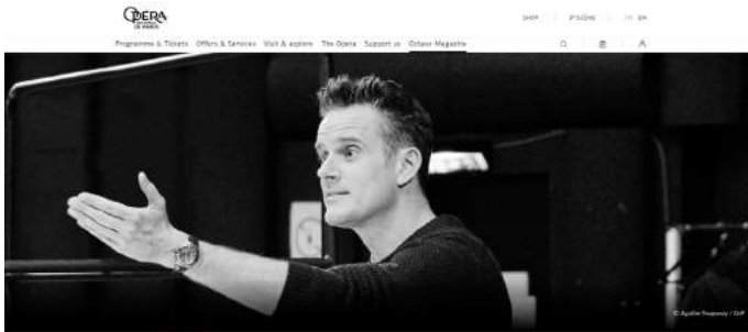
Close to the Russian soul

to Yuri Grigorovich, in the spring of 2019, with help from Severstal, the premiere of The Winter's Tale was held at the Bolshoi Historic Stage. See more on.