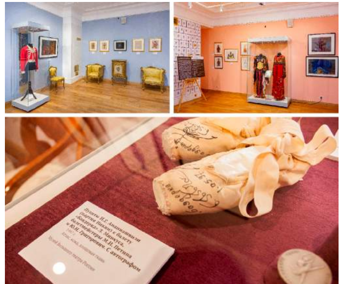
The exhibition Theatre Fairytale