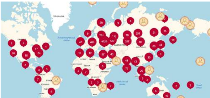
Members of the project Open the Bolshoi History on the world map

The project Open the Bolshoi History in Russia-24 report about the International Volunteers' Day.