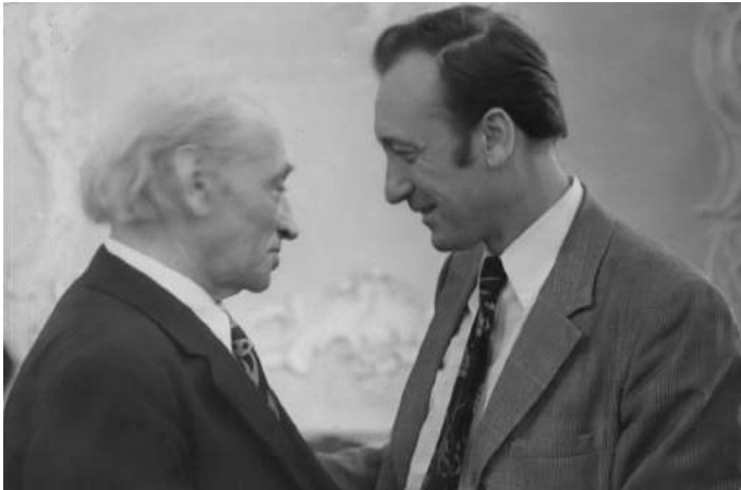
Rodion Schedrin and Yehudi Menuhin, 1979.

December 21 — Bolshoi ballet master, Bolshoi ballet dancer 1988-2011, National Artist of Russia, Nadezhda Gracheva - anniversary.