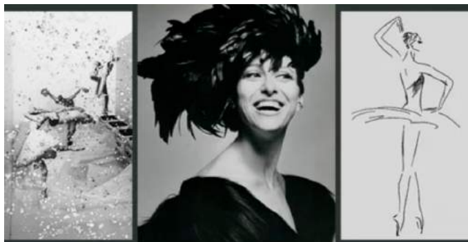
The all-out installation I, Maya Plisetskaya opened to the public on December 18 in the gallery-workshop GROUND Solyanka

The art director of the project is the National Artist Andris Liepa.