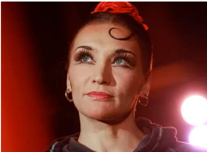
Nadezhda Gracheva

December 21 — Bolshoi ballet master, Bolshoi ballet dancer 1988-2011, National Artist of Russia, Nadezhda Gracheva - anniversary.