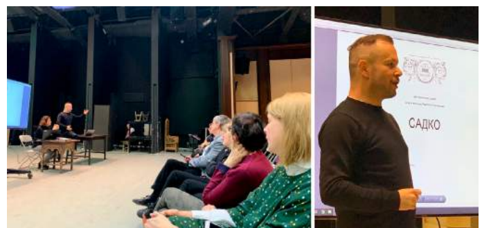
Production director Dmitry Tchernyakov started rehearsals of the opera Sadko, the Bolshoi Theatre, December 24.

The director has started rehearsals on December 24.