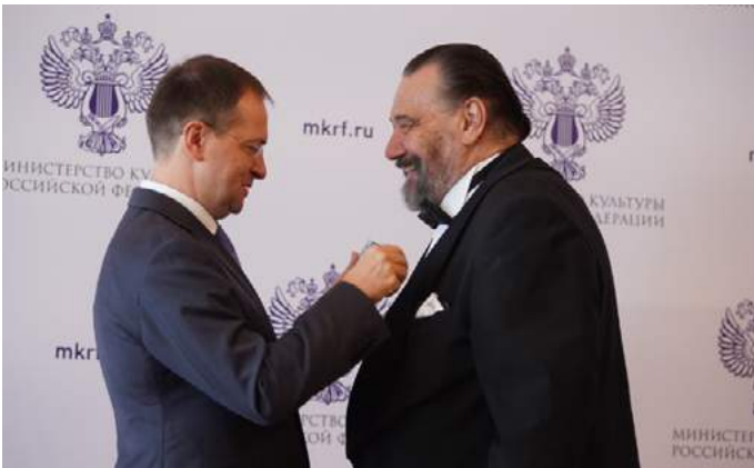
Minister of Culture Vladimir Medinsky and Vladimir Matorin.

The order For Merit to the Fatherland, 4th rank, was given to the Bolshoi Ballet prima Svetlana Zakharova.