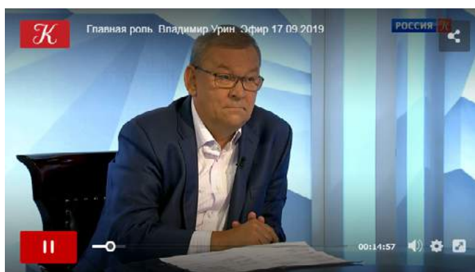
The Bolshoi CEO Vladimir Urin in the Main Role on Kultura channel

The Bolshoi CEO Vladimir Urin was the guest of the Main Role programme on Kultura channel and spoke about the opening of the 244th season and the artistic plans of the Bolshoi for the upcoming year. The programme aired on September 17.