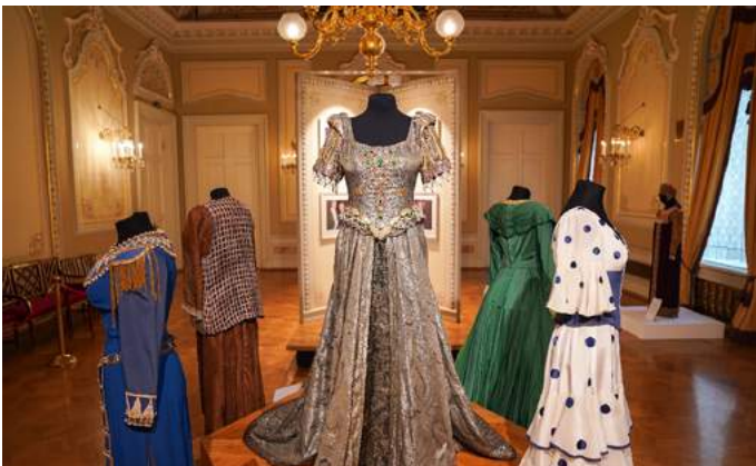
The exhibition of the 80th anniversary of the year of the birth of Elena Obraztsova.