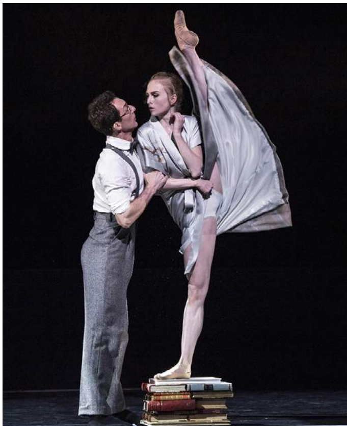
Hedda Gabler by Norwegian National Ballet.

The ballet Hedda Gabler at Operahuset website