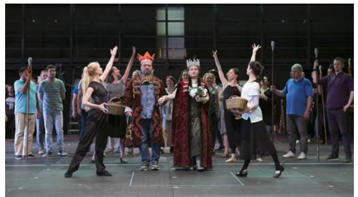
The rehearsal of The Tale Of Tsar Saltan opera.

September 26, the New Stage – the first opera premiere of the 244th season, in honour of 175 anniversary of the birth of Nikolai Rimsky-Korsakov and the 220th anniversary of the birth of Alexander Pushkin – The Tale Of Tsar Saltan , libretto by Vladimir Belsky after Alexander Pushkin’s tale of the same name. Also on September 27, 28 (12:00 and 19:00), 29 (14:00) .