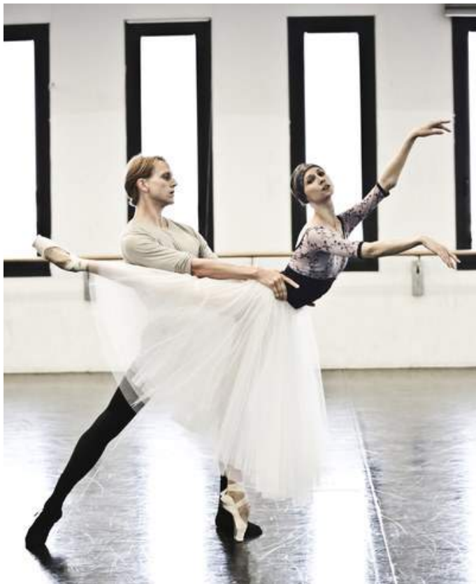
Svetlana Zakharova and David Hallberg

Hallberg mentions, “The Bolshoi interests me, I’m absorbing everything: even in Moscow, in Russia, a country that can be very difficult for people, culture, but I like to experiment, it’s like living another life.”