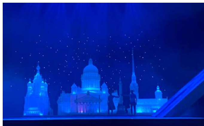
The Tale of Tsar Saltan, premiere on September 26.

“It is a very important fact that this season brings two operas by Rimsky-Korsakov – The Tale of Tsar Saltan and the epic Sadko – in a row. We added Mazepa for a reason, too, in a concert version. It is maybe one of the best and most well known scores by Tchaikovsky,” the chief conductor and music director of the Bolshoi Tugan Sokhiev said.