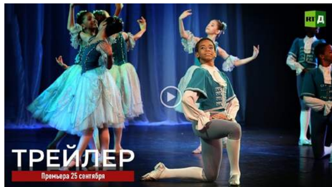
The trailer of Bolshoi: Pas-de-Brazil is available on YouTube