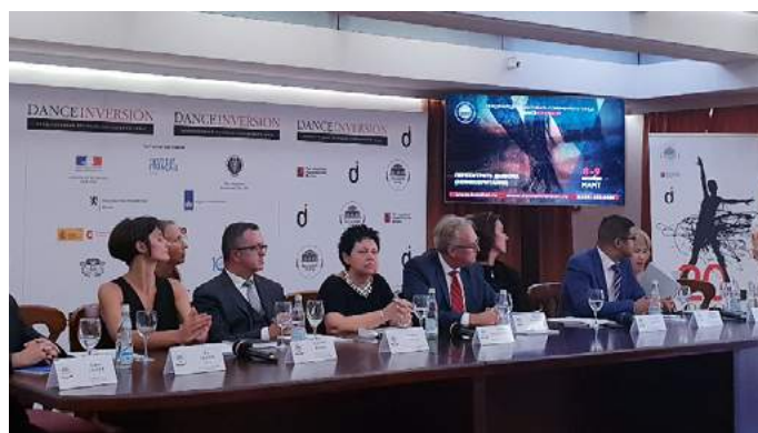
Participants of the 20th International contemporary dance festival DanceInversion opening press conference.

Immediately following the press conference, at the Bolshoi New Stage, a version of The Rite of Spring by Peacock Contemporary Dance Company was presented.