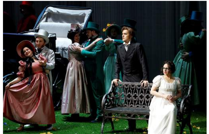
Eugene Onegin at the Historic Stage opening the 244th season.