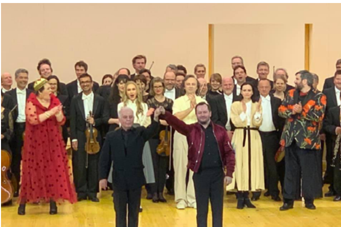
The premiere of The Betrothal in a Monastery at the Staatsoper in Berlin, April 13.