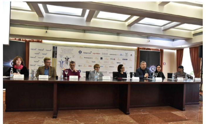
April 11, the Bolshoi Theatre press centre

On April 11, the Bolshoi Theatre hosted a press conference for the XXVII Benois de la Dansé International Ballet Prize , where the organisers spoke in detail about the gala concert programme and announced the nominees. The permanent chairman of the jury is Yuri Grigorievich.