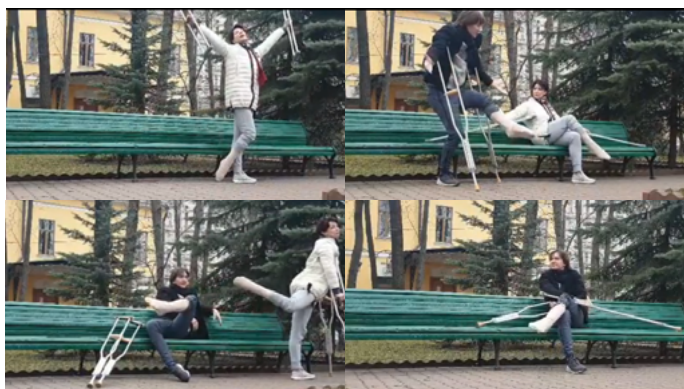
From the Life of Vacationers on the Instagram by Maria Alexandrova

Pas de deux From the Life of Vacationers is published on the Instagram by Maria Alexandrova, who is undergoing rehabilitation after a professional injury, as Vladislav Lantratov is, too. The humour of this “comic dumb” scene is still sad, though life-giving. All the visitors to their pages on social media wish the favourite artists the quickest recovery.