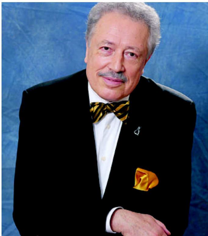
«Sometimes he came straight from the concert ...»