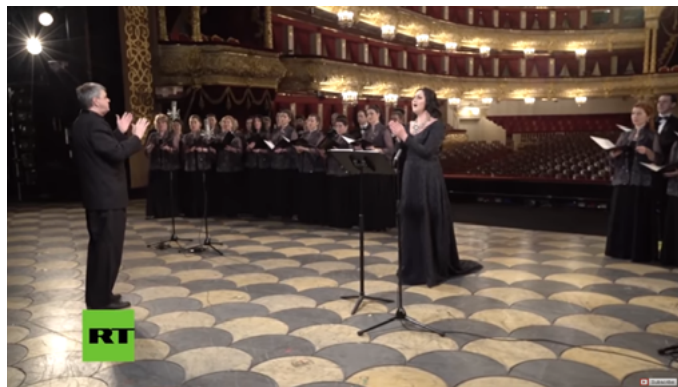
The video published by the news agency Russia Today