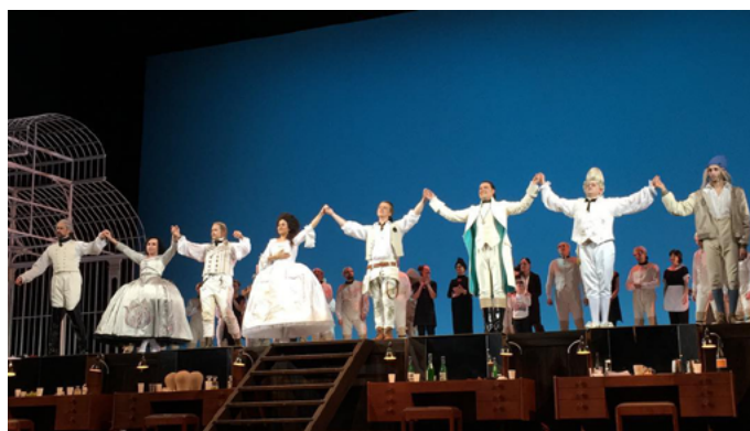
Curtain calls after the performance of Il Barbiere di Siviglia on April 10.

April 16, 17 and 18 at the New Stage — Sergei Prokofiev’s Romeo and Juliet in choreographic version by Alexei Ratmansky.