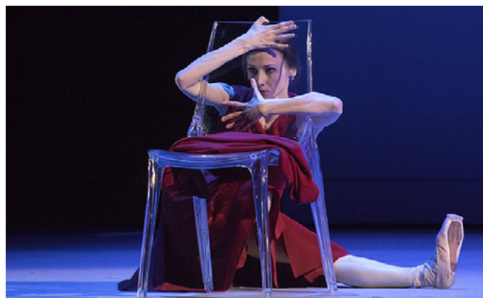
Svetlana Zakharova as Anna Karenina.