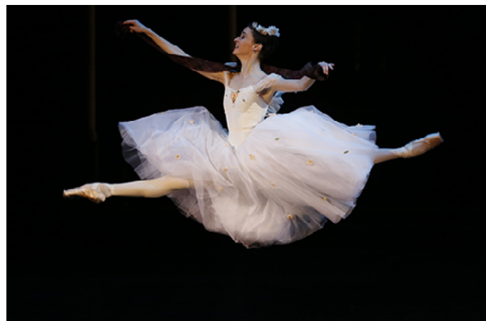
April 23, 24 and 25 at the New Stage – La Sylphide. Anna Nikulina in the main part.

Renowned Danish dancer and choreographer Johan Kobborg staged this romantic ballet by August Bournonville at the Bolshoi.