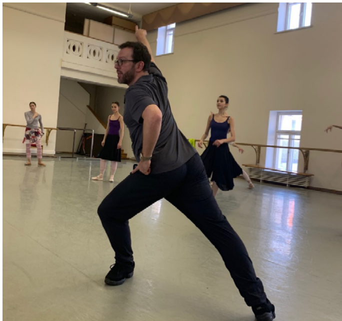
Alexei Ratmansky was in Moscow for the rehearsals with the artists of the Bolshoi.

April 20 (12:00 and 19:00) and 21 at the New Stage – Boris Asafiev’s ballet The Flames of Paris in choreographic version by Alexei Ratmansky with use of the original choreography by Vasily Vainonen.