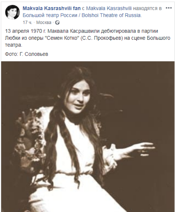
Makvala Kasrashvili fan