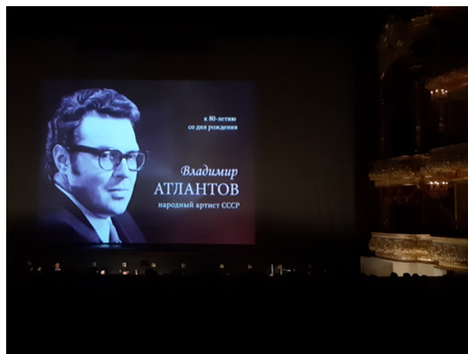
La Traviata performance of April 20 was dedicated to National Artist of the USSR Valdimir Atlantov

Atlantov’s family including his grandson Mikhail attended the performance.