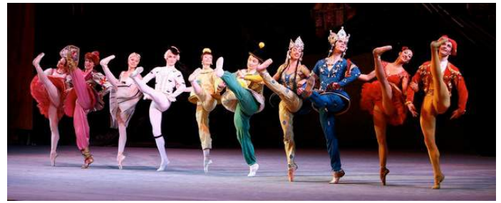
The Nutcracker. Puppets.

• RiminiNews24.it (Italy) announces the upcoming screening of Bolshoi's Spartacus in local cinemas