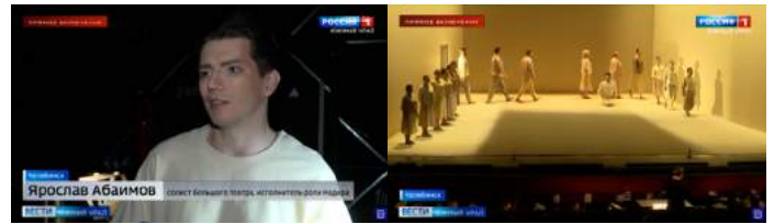
Russia-1 - Vesti South Ural video fragments

Rossia -1 (Chelyabinsk) “The Indian Ocean and marine themes are on stage at Chelyabinsk Opera Ballet. This