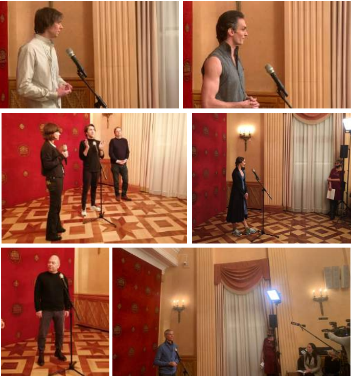
Master and Margarita production team and performers before dress rehearsal in the New Stage foyer. November 30.

• December 4, 12:00, the Historic Stage - the Bolshoi Children's Choir and Young Artists Opera Programme concert On the Way to Christmas .