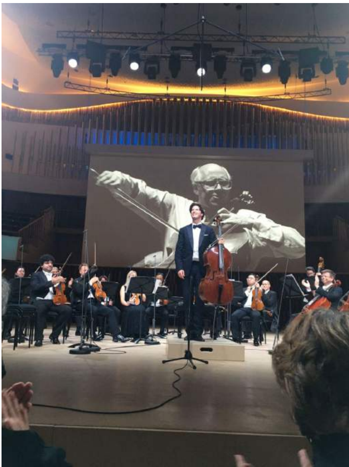
German cellist Daniel Müller-Schott performed Joseph Haydn's Concerto for Cello and Orchestra at the opening of the Mstislav Rostropovich International Festival.

• The 12th Mstislav Rostropovich International Festival started in Moscow on December 2 (it will run through December 11.) Musicians and ensembles from Argentina,