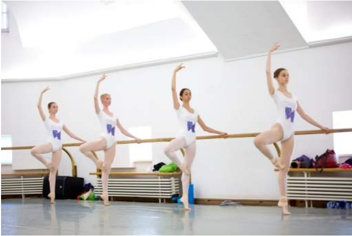
Members of the Young Artists Ballet Programme, launched by the Bolshoi Theatre and Ingosstrakh, got a chance to perform with the theatre's ballet company.

• Business News Agency reports that the Bolshoi Theatre and the Ingosstrakh company continue to implement the Young Artists Ballet Programme - the article The First Pas on the Big Stage . Two students from the project's first apprentice group got a chance to perform at the Bolshoi Historic Stage.