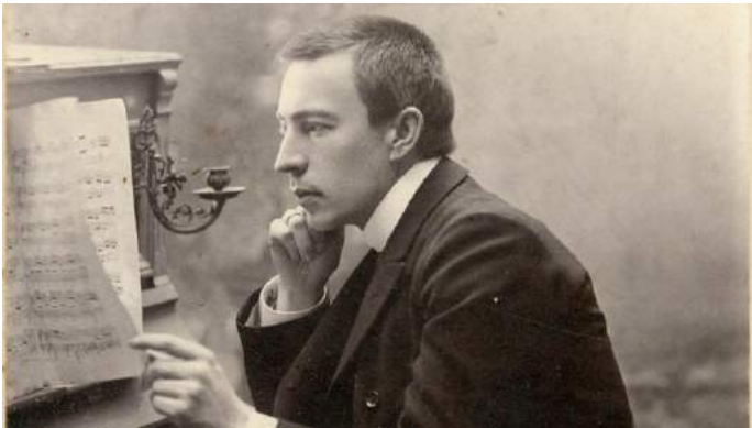
Sergei Vasilyevich Rachmaninov

TASS (republication — ClassicalMusicNews.ru ) reports: