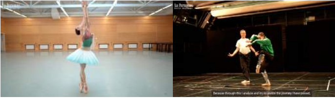
Shots from the film Olga Smirnova - SUPERNOVA - marks the 10th anniversary of the ballerina's creative activity

...speak for her - so real, not like others, always infinitely sincere. It is impossible not to admire her ability to serve the ballet, build the performance in layers, bring deep meaning into the dance and convey all this through plastique.