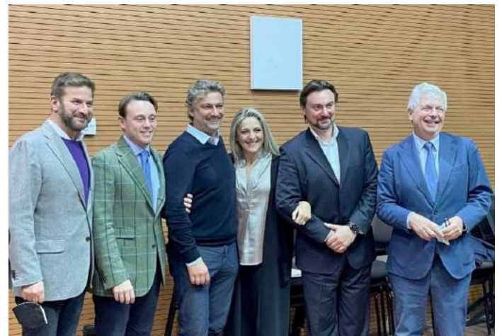
Press conference before the premiere of Otello in Naples.