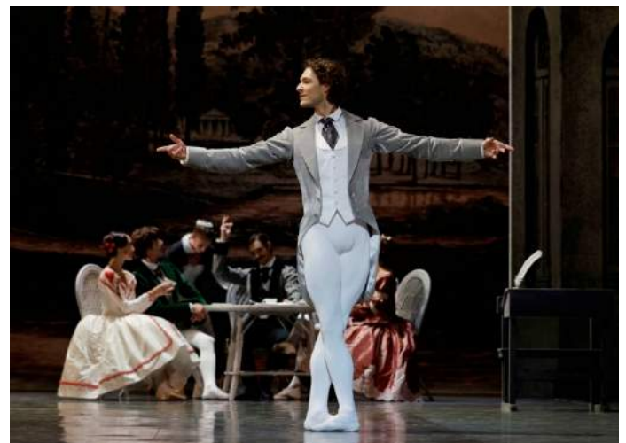
Paris Seasons TheatreHD : ballets Le Rouge et le Noir by Pierre Lacotte and the Swan Lake by Angelin Preljokaj - in Russian cinemas.

The nearest performances in Russian cities — within Paris Seasons — Le Rouge et le Noir by Pierre Lacotte and the Swan Lake by Angelin Preljokaj.