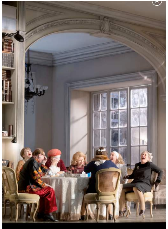
Strauss' Elektra staged by Dmitri Tcherniakov – November 28 at Hamburg Staatsoper