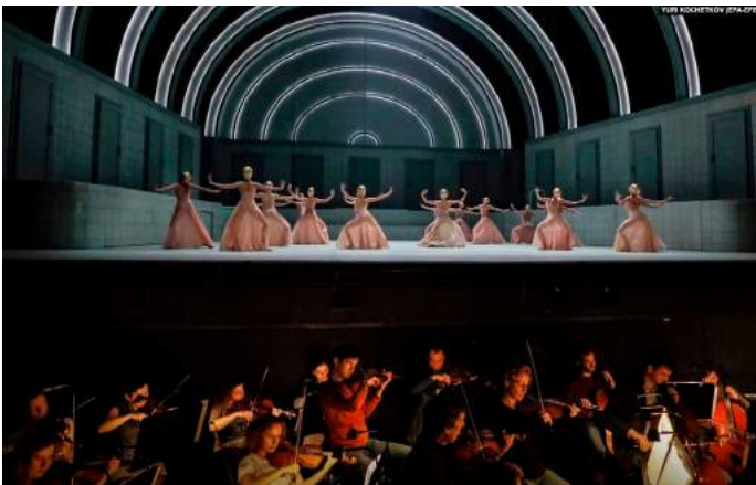
Master and Margarita dress rehearsal at the Bolshoi New Stage.

The website of the international broadcaster Radio Free Europe chooses the most compelling photographs from the 48th week of 2021 from around RFE/RL's region. This includes a photo from Bolshoi's Master and Margarita. Three dancers perform during a dress rehearsal of the ballet Master And Margarita to music by Alfred Schnittke and Milko Lazar at the New Stage of the Bolshoi Theatre in Moscow. The ballet is based on the novel of the same name by Mikhail Bulgakov."