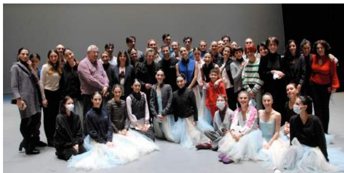
State Ballet of Georgia , November 21: “Mikhail Baryshnikov visited our theatre today and attended our George Balanchine evening. Before the performance, Baryshnikov met with the ballet company and wished us a successful performance.”