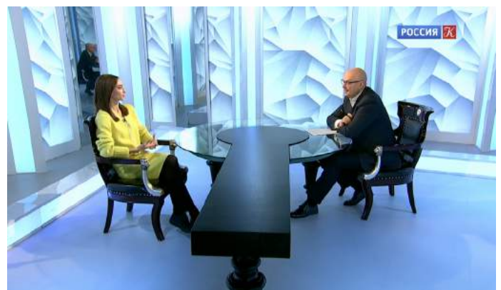
Olga Smirnova in the Main Role programme at Kultura channel

The Main Role on Kultura channel features Olga Smirnova, the performer of the role of Margarita. The prima ballerina talks about the work on the performance in general and on the role, in particular. The premiere of the ballet Master and Margarita at the Bolshoi Theatre - December 1-5.