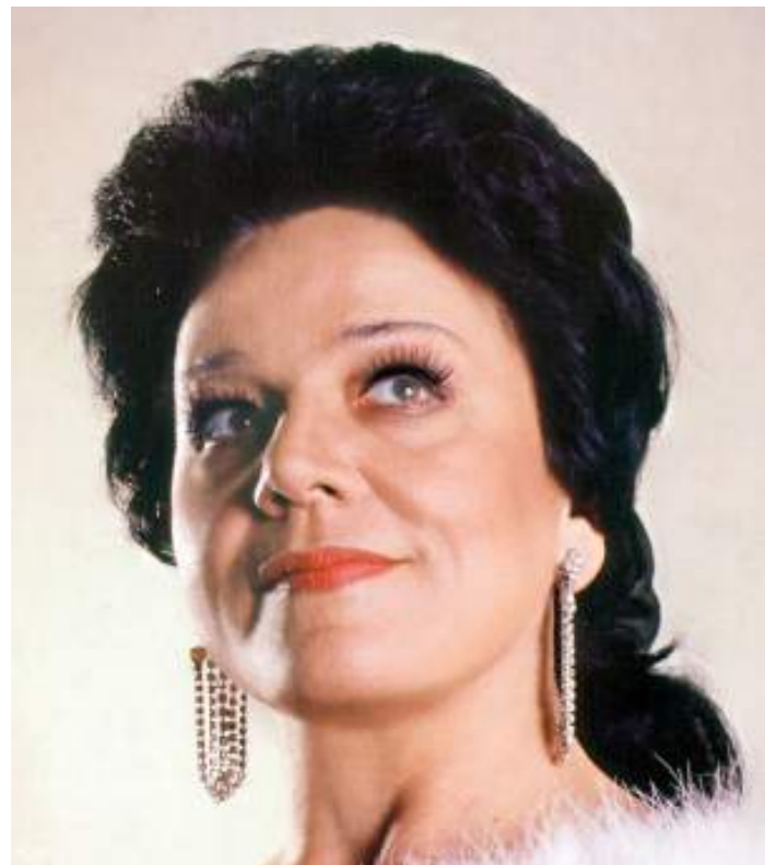
The 10th International Opera Singers Competition St Petersburg dedicated to the memory of Irina Bogacheva - from November 25 to December 3, 2021

• The 10th International Opera Singers Competition St Petersburg , dedicated to the memory of its initiator,