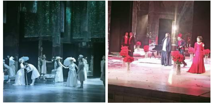
Opera The Idiot by Mieczysław Weinberg at the New Stage.