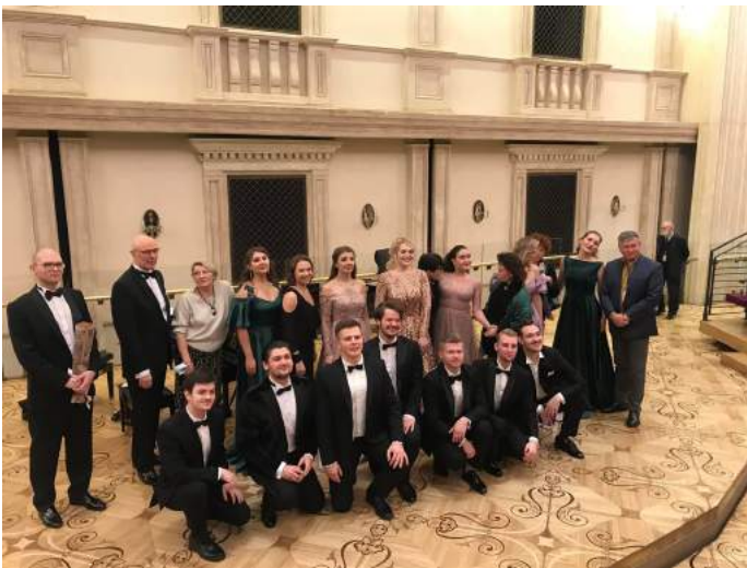
The Bolshoi YOP members and teachers at Beethoven Hall, November 23.