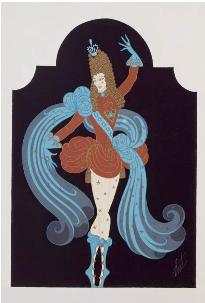
Prince Charming costume, 1921. A sketch for The Sleeping Beauty by Dyaghilev's Ballets Russes - an exhibition dedicated to Roman Tyrstov (Erta) opened at Zaryadye.

• On November 23, an exhibition dedicated to Roman Tyrstov (Erta) , a Russian designer, artist, sculptor, one of the world's most famous representatives of Art Deco style, who lived for almost 100 years (1892-1990), opened in the Old English Courtyard of Zaryadye Park. Erte. A Century-Long Fantasy will continue the cycle of single exhibitions by the Podklet project, which are held in a white-stone podklet (ground floor) where the masonry of the 16th century is preserved. Roman Tyrstov was lucky to work with Paul Poiret, Sergei Diaghilev, Anna Pavlova and Mata Hari, he designed costumes for Fred Niblo's and Toda Browning's films in Hollywood, created covers for Harper's Bazaar and Vogue in 1920s and 1930s. The central object of the exhibition is the sculpture Byzantium, created by Erte in 1988. Next to it is a digitised version of the 1985 painting of the same name, its elements have been «brought to life» with the help of motion design. All the main aspects of Erte's work are most fully expressed in the sculpture and the painting: love for ancient civilisations, Russian Seasons and Art Deco.