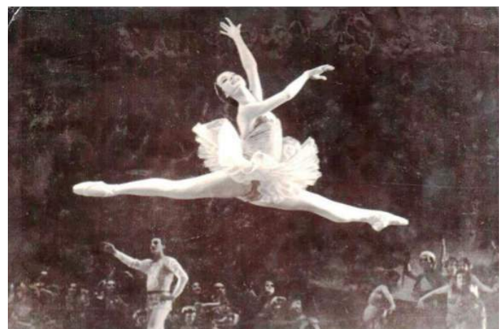
A postcard "The ballet Raymonda. Elena Ryabinkina." M.: IZOGIZ, 1960

"The ballet Raymonda is the performance in which Elena Ryabinkina shone on this stage for many, many years, performing the title role. Elena Ryabinkina belongs to the generation of those remarkable ballet stars of the Bolshoi, who have written a golden page in its history with their brilliant creativity. Lena Ryabinkina, a Moscow Ballet School graduate, was noticed by Leonid Mikhailovich Lavrovsky, the Bolshoi chief choreographer of the time. He highly