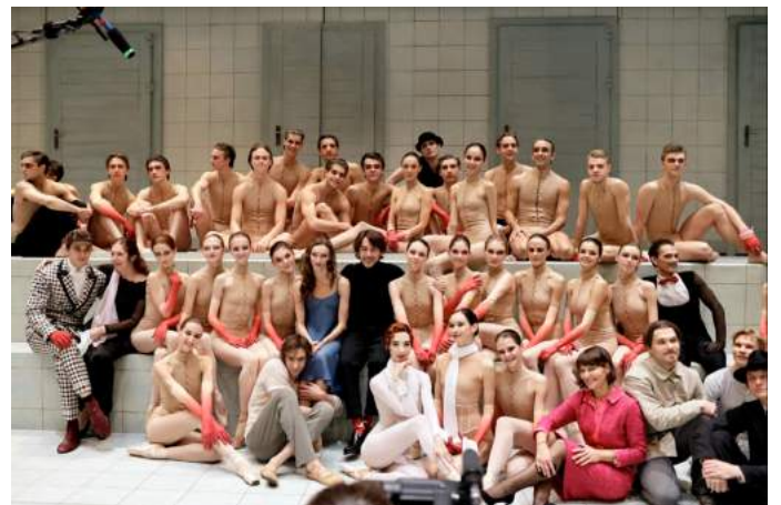
Behind the scenes after the premiere on December 1.

“The choreographer had lots of different ideas. We tried to fly for real, use special effects. This scene stayed under construction until the last moment, and only at the final run it became clear what it looks like, « said Olga Smirnova, Bolshoi prima ballerina.»